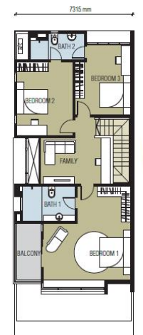
First Floor 一楼

* The land configuration dimensions, backyard staircase and area vary from unit to unit. A copy of the plan showing the actual configuration and measurements of any lot can be made available upon request.