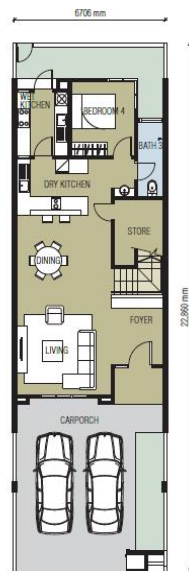
Ground Floor 底楼