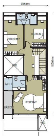
First Floor 一楼